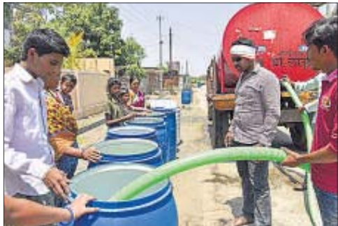
■ A tanker provided by the Latur municipal corporation.

session, the Opposition ensured the drought situation was debated and the government was made to reply on various subjects every week.