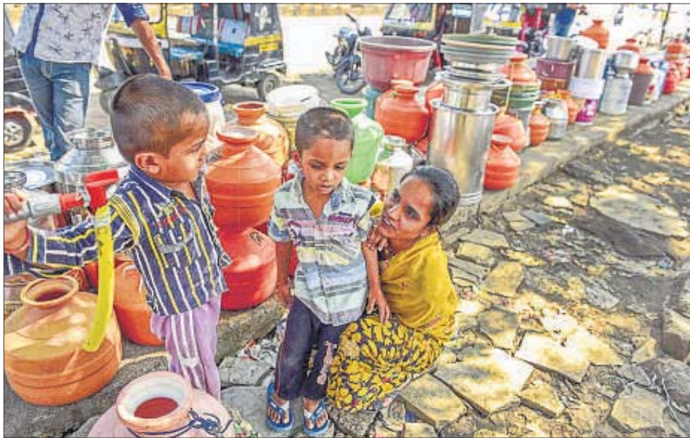
■ Latur residents have to wait in a queue for at least five-six hours to get drinking water.