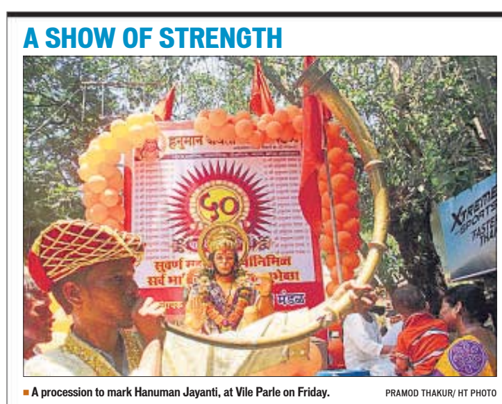
■ A procession to mark Hanuman Jayanti, at Vile Parle on Friday.

Following this, the government agencies moved the HC, which stayed the tribunal's order of depositing the said amount, and constituted another committee above the one formed by the tribunal. Vanashakti then filed the SLP