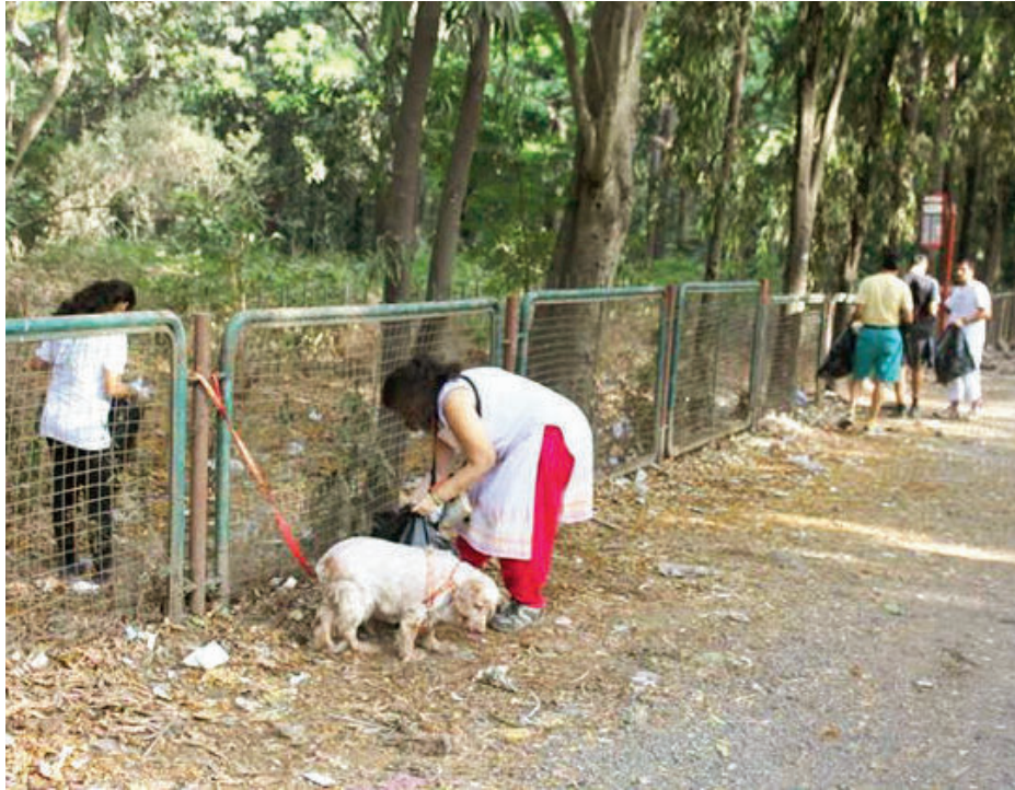
Locals collect garbage in Aarey Colony. BMC is helping with the process of garbage segregation