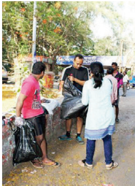
The drive also aims to increase green cover

"The movement has already started. To clean up Aarey, we are taking the help of the BMC, several NGOs, morning walkers and those involved with the Swachh Bharat Abhiyaan. The BMC is helping us with garbage segregation by providing containers. Such drives have already taken place at a New Zealand hostel and